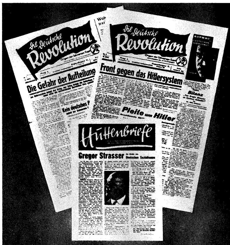
THREE SPECIMENS OF THE MINIATURE ANTI-HITLERIST NEWSPAPERS PRINTED ON FLIMSY PAPER BY OTTO STRASSER AND SMUGGLED INTO GERMANY