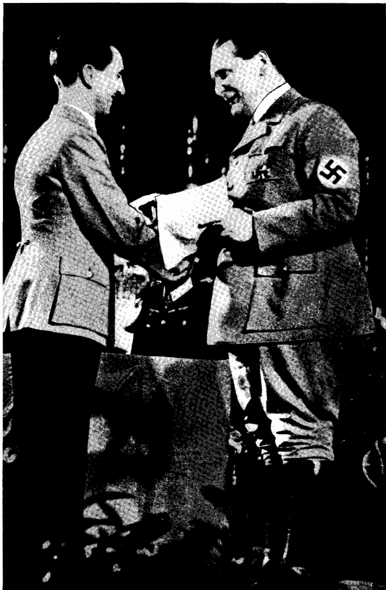
GOEBBELS AND GÖRING