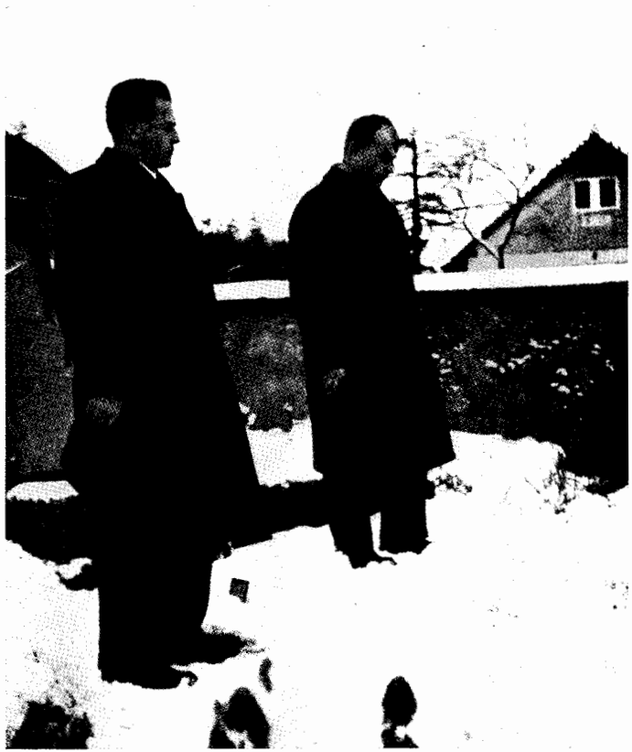
OTTO STRASSER AT THE GRAVE OF RUDOLF FORMIS