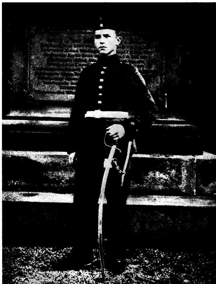
OTTO STRASSER AS A VOLUNTEER IN A LIGHT CAVALRY REGIMENT, 1914