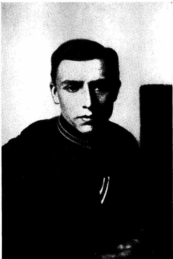
OTTO STRASSER AS A NON-COMMISSIONED OFFICER, 1915