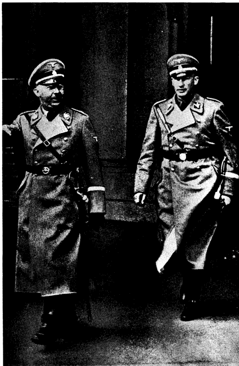
HIMMLER AND HEYDRICH